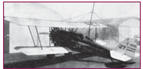
A Pitcairn Aviation Mailwing in use delivering mail.

in flight school, left the Thomas Morse Aircraft company to join Pitcairn. In the late 1920s, they bid on and won a contract airmail route, C.A.M. 19, but soon realized that the aircraft of the time were too large and slow to be profitable, so they created the PA-5 Mailwing, which proved to be so popular for airmail that it was bought by thirteen other companies.