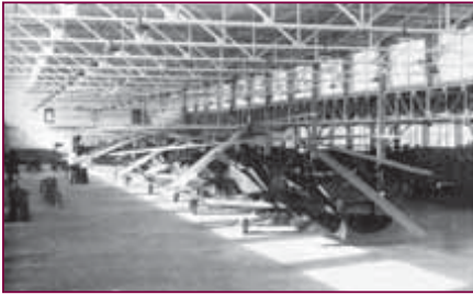
Completed Autogiros lined up for delivery at the Pitcairn Willow Grove factory.