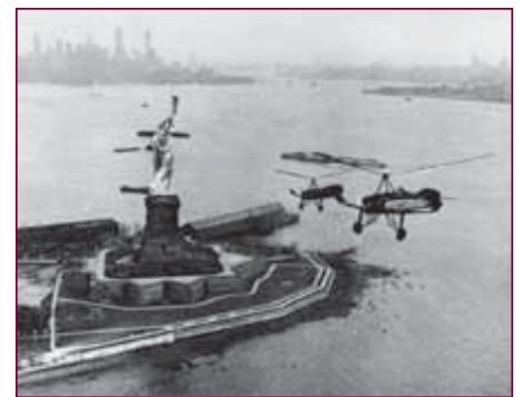
A PCA-1 and a PCA-2 flying over New York.

As Harold Pitcairn advanced rotary wing development through a series of original designs, including the PCA-2, PAA-1, PA-18, PA-19, PA-22, AC-35, and PA-36, he excited the public's imagination to the possibilities of such aircraft and amassed a portfolio of technical patents that would become vital to helicopter development in America.