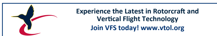
Sample VFS Banner Advertisement $1,000 USD (If Purchased Separately)

As an added bonus, your banner ad will also appear on the Forum 82 online registration page. Ensure that your company will be seen by top government and industry officials when registering for Forum 82 or viewing the Hover Community. Banner ads will appear in a rotation with other participating advertisers. No additional charge for banner ad creation. See the mechanical specifications table for banner ad technical requirements. All banner ads offer hyperlinks direct to your website.