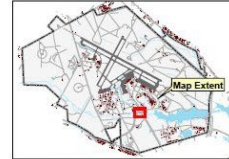
FAA WJH Technical Center