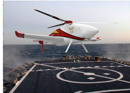
Huma: University of Maryland 1st Place Graduate Category

The 41 st Annual Student Design Competition (2023-2024) was entitled, "Multi-Mission Modular UAS for Disaster Relief." The goal of this year's request for proposal (RFP) was to design a multi-mission, modular, VTOL uncrewed aircraft system (UAS). Teams had to design an aircraft that was required to take-off and land vertically from the deck of ship in high-wings and gusty conditions, cruise to and from the site of disaster, and serve as a long-endurance communications relay, or land vertically to deliver relief supplies.