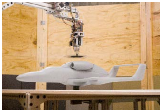
Groen built a sub-scale Heliplane model to measure airframe downloads.

According to a BBC story, UK government monitors claimed noise levels within 500 ft (150 m) of takeoff or landing were “intolerable.” By the time the program had been canceled, however, tip jets with significantly reduced noise had been designed.