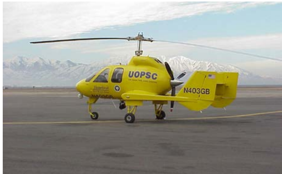
The Hawk 4 flew in support of the Salt Lake City Olympics in 2002. Skyworks Global plans to productionize the Hawk 4 gyroplane with improvements for the international market.

showed the worst design errors in accident-prone gyrocraft of other manufacturers were in the misplacement of rotor and propeller thrust vectors as related to aircraft center of gravity. Groen designed the hands-off stable SparrowHawk to fix the safety issues of kit gyroplanes.