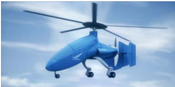
Groen's optionally piloted ScoutHawk, still in development, is aimed at overseas sales.