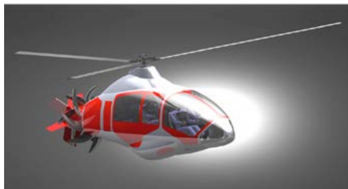
The conceptual ArrowHawk 6 gyroplane can be sized for six to nine seats in single-engine configuration and 10 to 16 seats in multi-engine form, depending upon market demand.

Cancellation of the Rotodyne in 1962 has been blamed in part on tip-jet noise that precluded operations from urban vertiports.