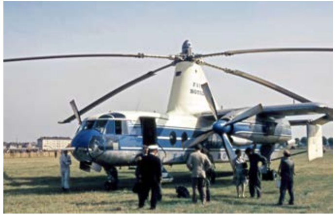
The Fairey Rotodyne (a legacy Westland demonstrator) first flew in 1957 and set a world speed record: flying at an average of 190.9 mph (307.2 km/h), over a 60-mile (100 km) closed circuit.

Phase I component and subsystem tests should have put a full-scale rotor system in a wind tunnel for Phase II. However, with Woodbury promoted to head the DARPA Strategic Technology Office and no military customer paying to transition the technology to production, the Heliplane was abandoned. “I’d love to see DOD pick this up and carry it forward,” offered Woodbury. “Consider what the gyrodyne has to offer before you lock into another 30, 40 or 50 years of helicopter or tiltrotor limitations.”