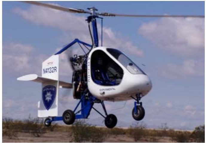
Skyworks Global intends to deliver new SparrowHawk III gyroplane kits this year sold through subsidiary American Autogyro International. The SparrowHawk law enforcement demonstrator was used briefly for drug interdiction on the Arizona border.