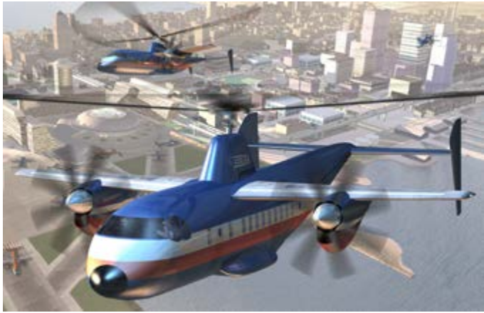
Skyworks Global's GyroLiner design could offload crowded airport runways and airspace with vertical takeoff departures and landing approaches. Like the Fairey Rotodyne, the tipjet-driven gyrodyne would transition to wing-borne lift to reach cruise flights above 200 kt (370 km/h).