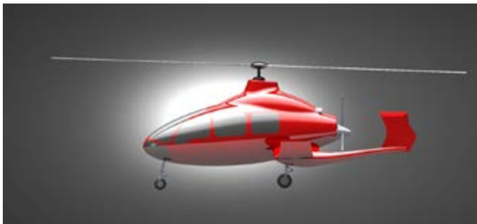
Concepts for Skyworks Global's gyroplanes are sized to carry four to six passengers and are tailored to markets without aviation infrastructure.

performance improved dramatically by being able to change collective pitch during descent. Collective pitch control could enhance gyroplane safety, especially in less-than-1G maneuvers. Collective pitch also enables gyroplanes to spin-up on the ground at flat pitch, store energy in the rotor, and take off vertically with rapid collective input as the aircraft accelerates. In addition, it provides a means to optimize rotor speed for greater cruise efficiency. The stable SparrowHawk III entered production without collective control for business reasons. However, collective pitch control will be introduced on the SparrowHawk IV and offered as an improvement kit for the earlier aircraft.